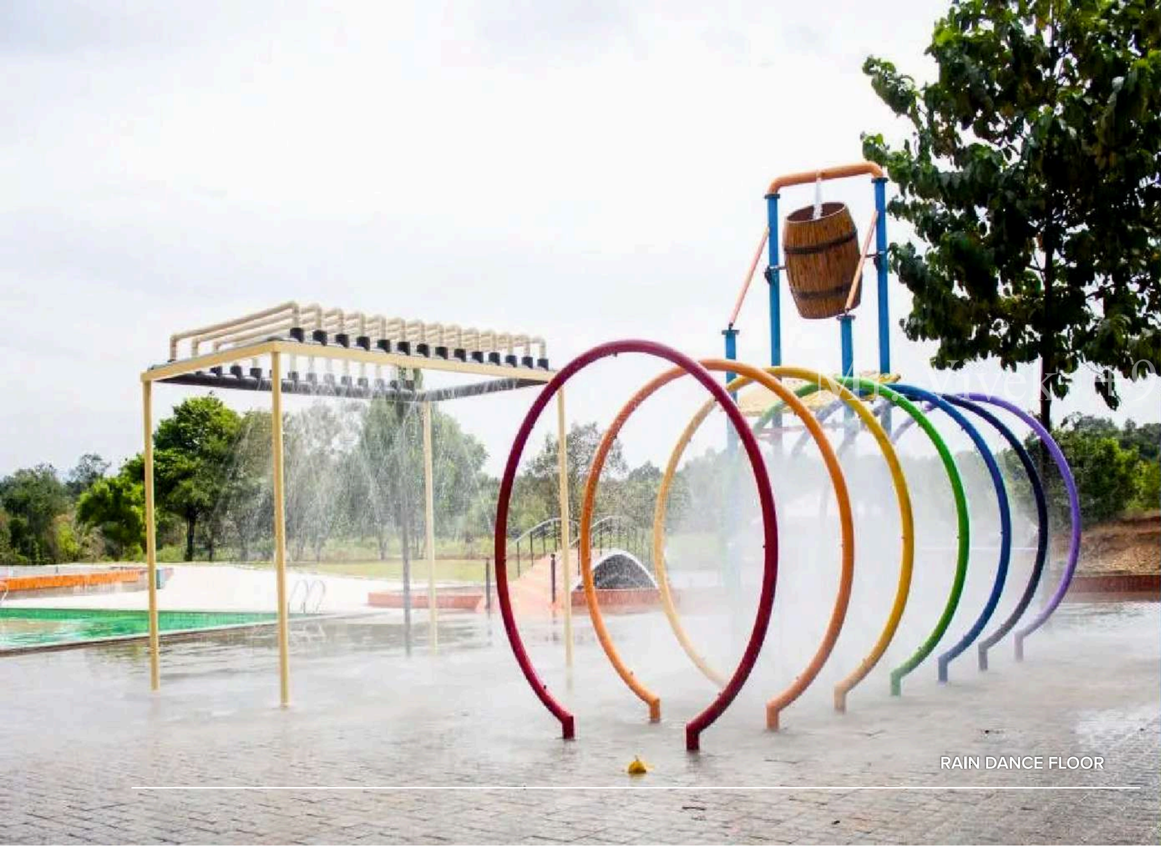
RAIN DANCE FLOOR